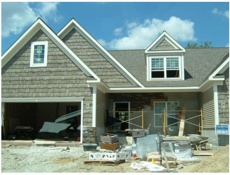
Amish builders build with real craftsmanship.