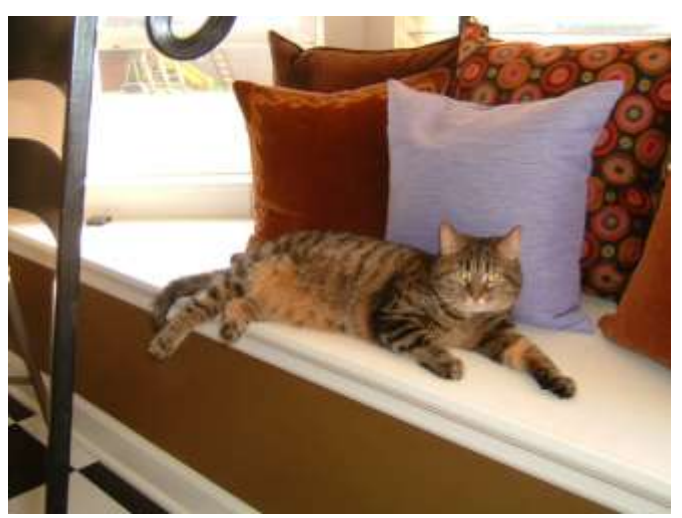
New grandkitty named Luna who was adopted the day I left Ohio on my 2nd trip to Ohio this summer. She's a real cutie and eats all the time!

Tombstones at Chagrin Falls, Ohio cemetery, dated turn of the 20th century (I wanted to visit cemeteries to start a collection of epitaphs...very hard to find.)