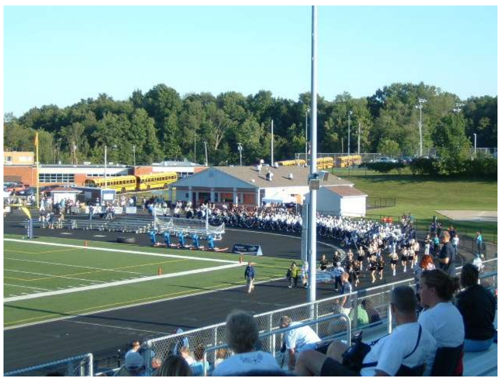
Cameron's first football game at home stadium behind the middle school--he's a drummer, August 27. The flag team precedes the band in full uniform as they march into the stadium and perform during pre-game and half-time. Cam's high school won the game. It was a perfect 72-degree evening.