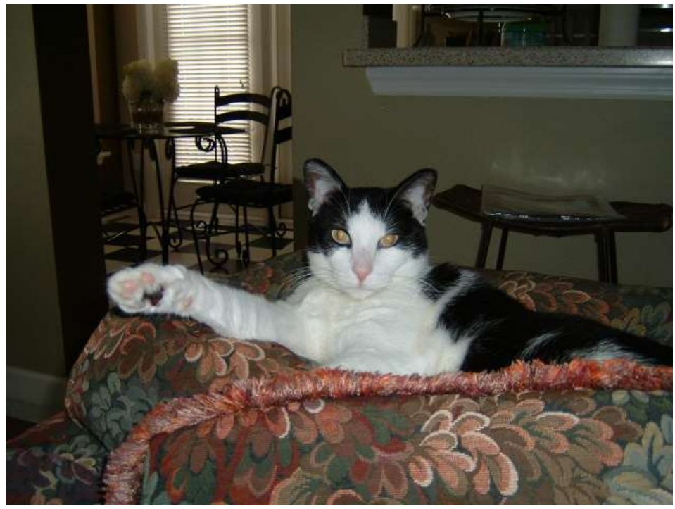
Roux, the first cat to join the family in Ohio