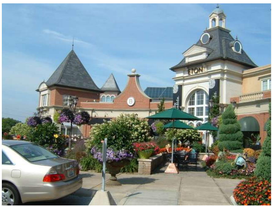
Shopping center where Trader Joe's is located--gorgeous plantings!