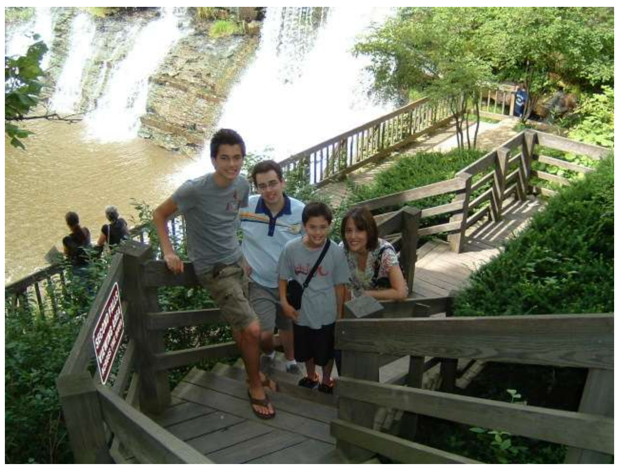
An outing to Chagrin Falls