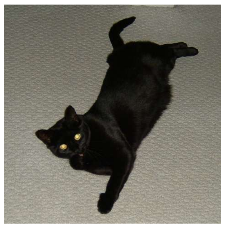
Kiki "Kikums," the midnight cat!