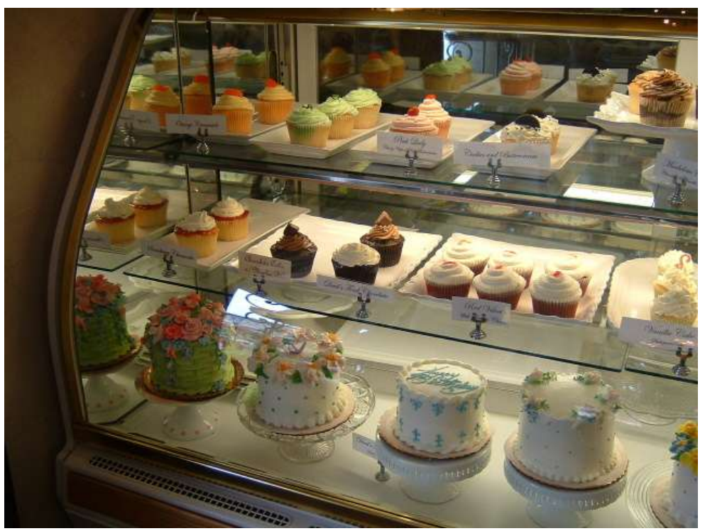
Chagrin Falls Bakery