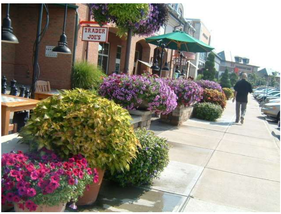
Entrance to Trader Joe's